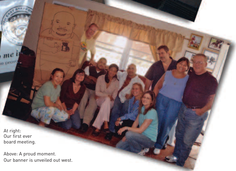
At right: Our first ever board meeting.